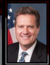
The Honorable Michael R. Turner Chairman, HASC Tactical Air & Land Forces