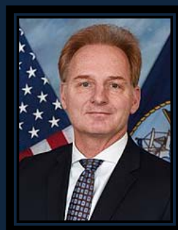
The Honorable Thomas B. Modly Under Secretary of the Navy