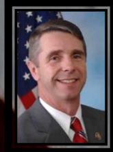
The Honorable Robert J. Wittman Chairman, HASC Seapower & Projection Forces