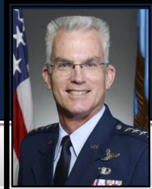
General Paul J. Selva Vice Chairman of the Joint Chiefs of Staff