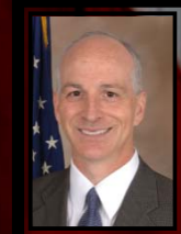
The Honorable D. Adam Smith Ranking Member, House Armed Services Committee