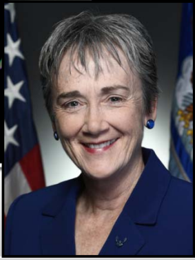
The Honorable Heather A. Wilson Secretary of the Air Force