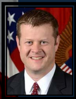
The Honorable Ryan D. McCarthy Under Secretary of the Army