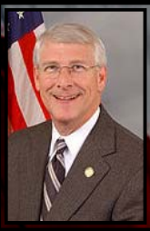
The Honorable Roger F. Wicker Chairman, SASC Seapower